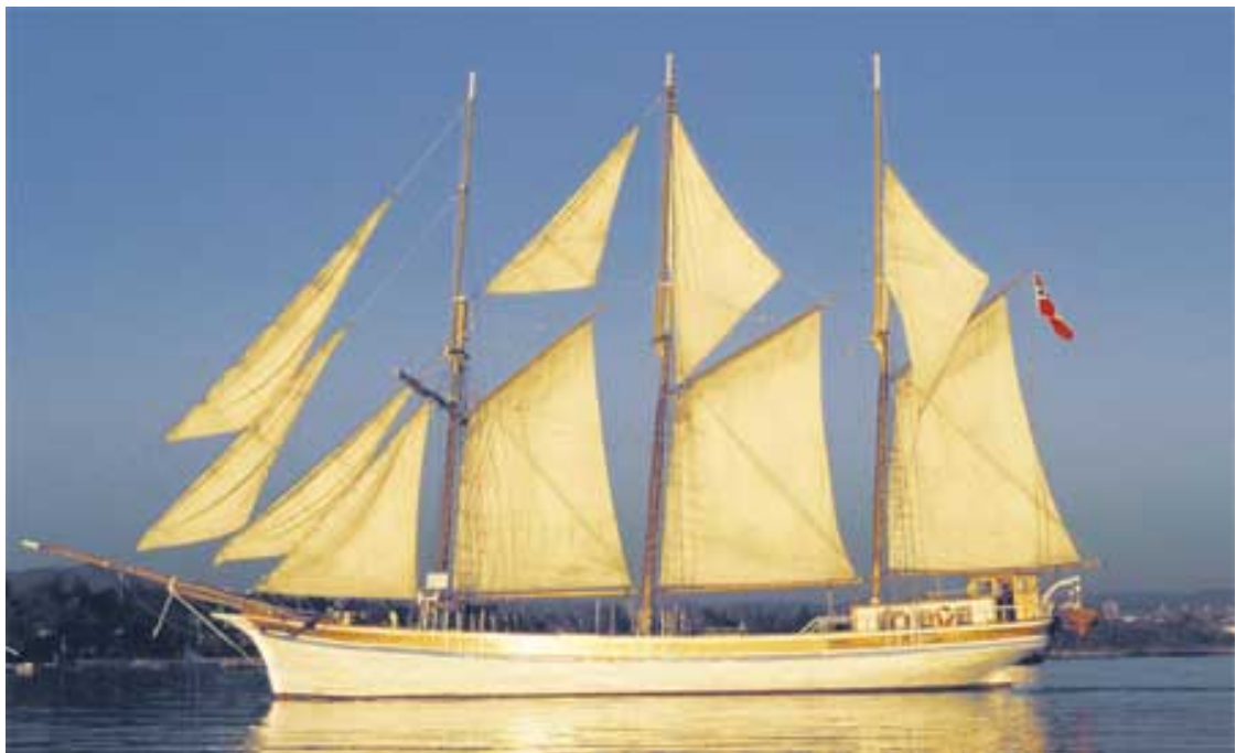
Photo: SS Christiania, Monday evening there is a boatrip and dinner onboard.